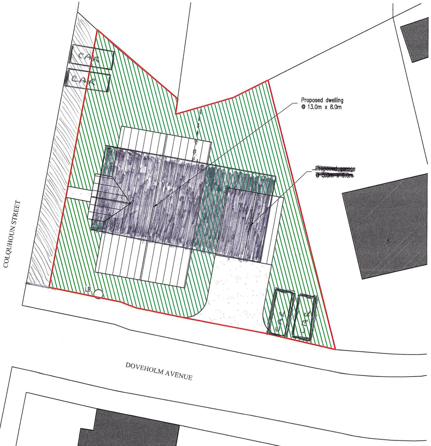
SITE PLAN - AS PROPOSED 1:200

DRAWN REF No DRG No REV No 06/11/20 20.11.01 02 A